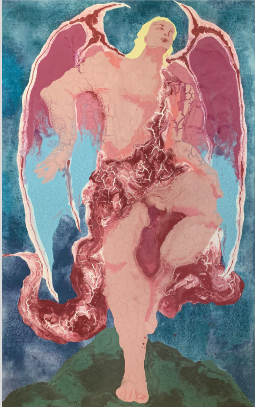
Aurora , Acrylic Paint and Marble Dust on Canvas, 190 x 120 cm, 2021