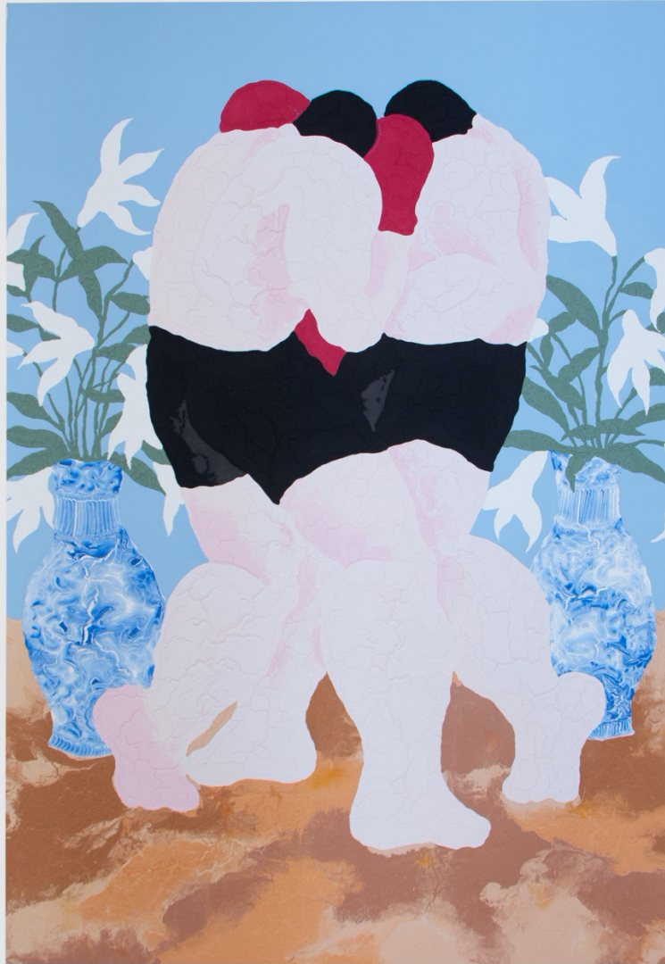
Magnolia in Fiore , Acrylic Paint and Marble Dust on Canvas, 190 x 130 cm, 2021