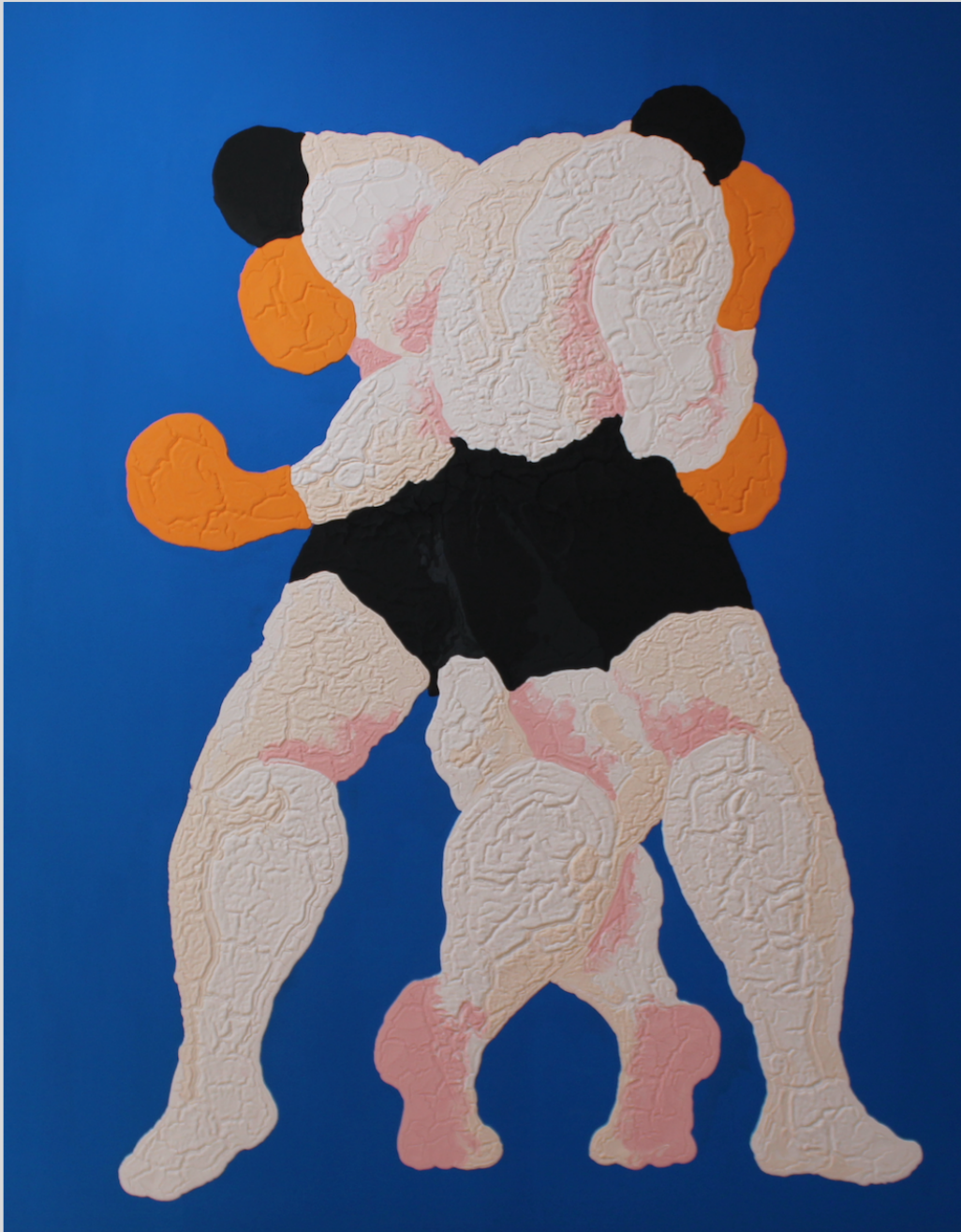
Sweet Science (NYC Sunrise) , Acrylic Paint and Marble Dust on Canvas, 190 x 150 cm, 2021