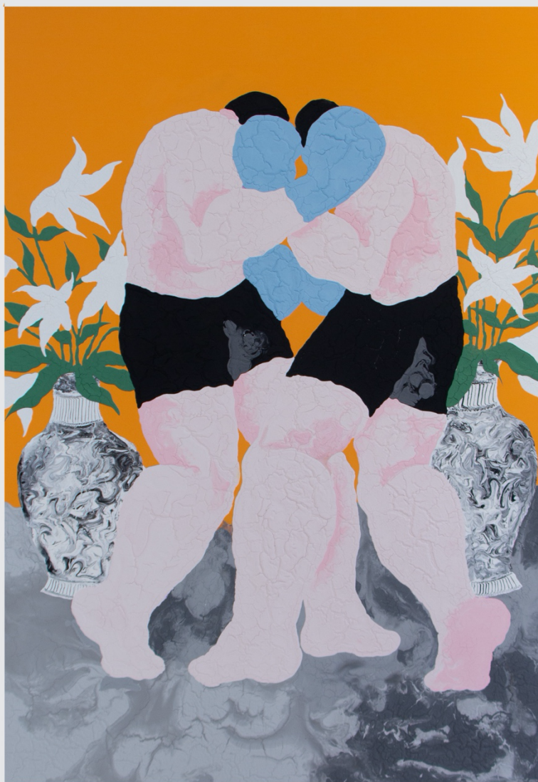
Fuoco in Cairo , Acrylic Paint and Marble Dust on Canvas, 190 x 130 cm, 2021