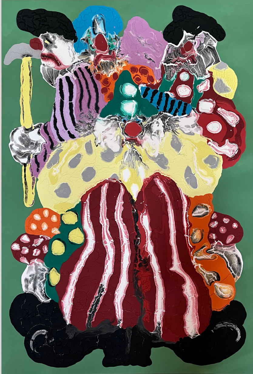
Sassopiatto, Acrylic Paint and Marble Dust on Canvas, 190 x 130 cm, 2022