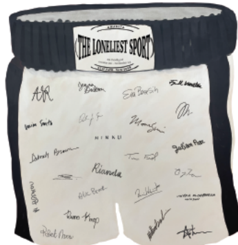
The Loneliest Sport , 2021

Location: 43 Crosby Street, New York, NY Dates: October 22 - November 18, 2021 Opening: October 22, 2021, 6:00pm - 9:00pm