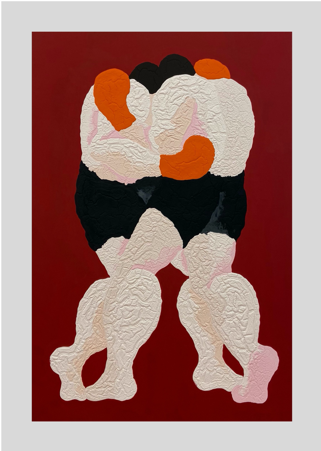
Law of Grace , Acrylic Paint and Marble Dust on Canvas, 190 x 130 cm, 2021